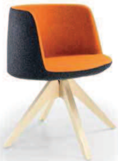
BALLOON WOODEN SWIVEL BASE WHITENED ASH