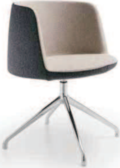
BALLOON POLISHED ALUMINIUM SWIVEL BASE