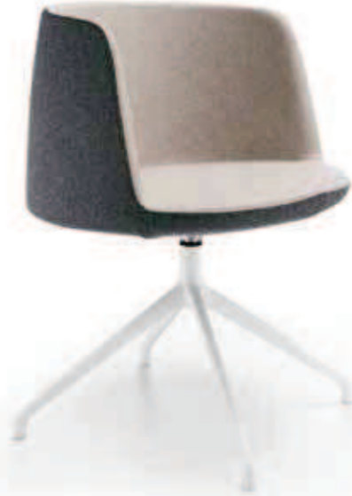
BALLOON WHITE PAINTED ALUMINIUM SWIVEL BASE