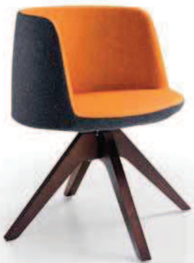
BALLOON WOODEN SWIVEL BASE WENGE ASH