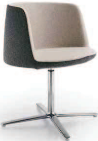
BALLOON POLISHED ALUMINIUM SWIVEL BASE