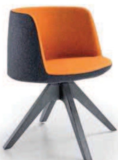
BALLOON WOODEN SWIVEL BASE GREY PAINTED ASH