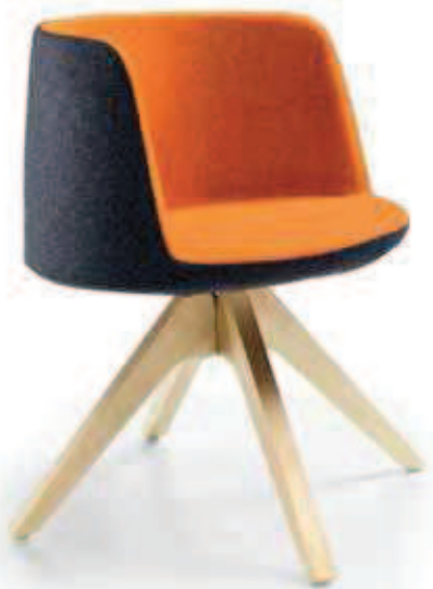
BALLOON WOODEN SWIVEL BASE NATURAL ASH