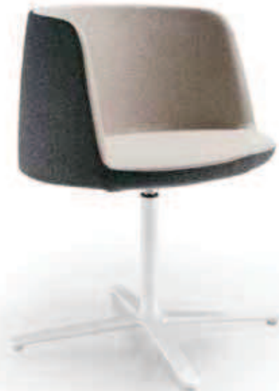
BALLOON WHITE PAINTED ALUMINIUM SWIVEL BASE